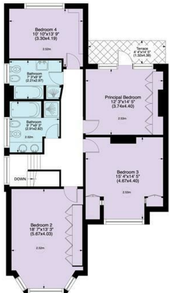
First Floor - Approx 103 Sq m - 1105 Sq ft